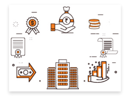
Multiple Department Ownership