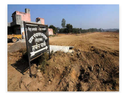
Encroachment By Public Or Govt. Departments