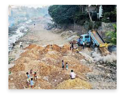
Construction Work On/Around Johar Land