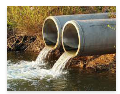
Direct Sewage Connection