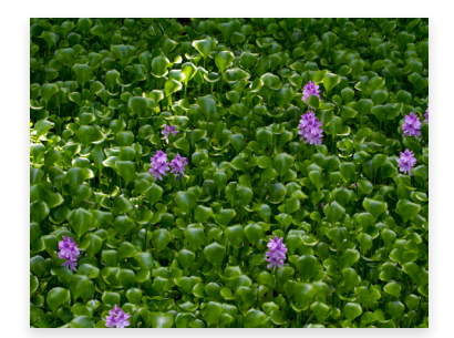
Water Hyacinth Due To Imbalance Of Nutrients