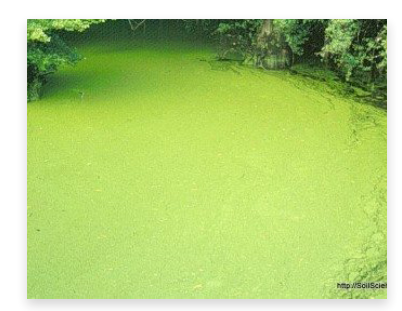
Algae in Ponds